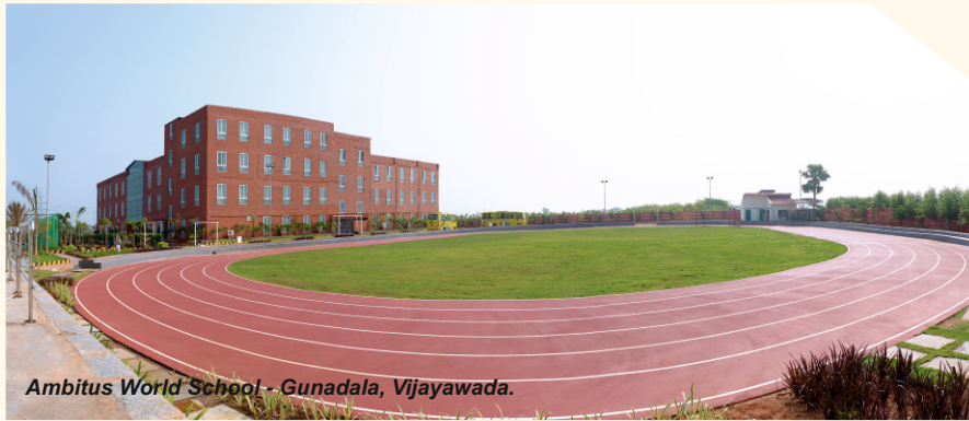
Ambitus World School - Gunadala, Vijayawada.