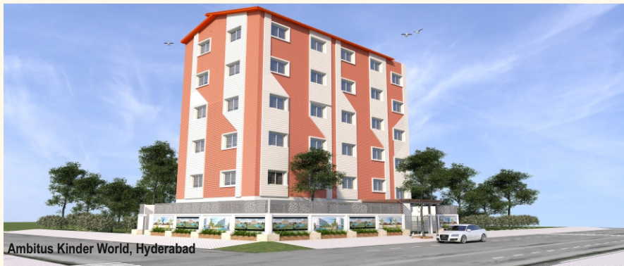
Ambitus Kinder World, Hyderabad